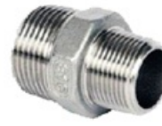
Hexagon Nipple Reducing