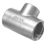
Tee Equal Non- Banded