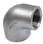
Elbow 90 Non- Banded F/F