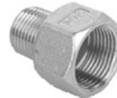
Negative Hexagon Bushing M/F