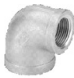
Elbow 90 Equal Banded Socket Weld