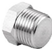
Hexagon Plug, Parallel (Cylinder) Thread