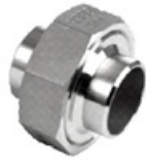
Union Flat Seat with Teflon Gasket BW/BW