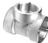
Tee Equal Banded