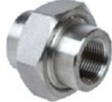
Union Conical F/F