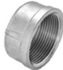
Round Cap Banded