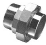
Union Conical Joint BW/F