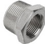
Hexagon Bushing M/F