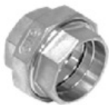
Union Conical Joint Socket Weld