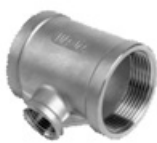
Tee Banded Reducing