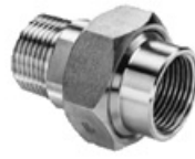
Union Conical M/F