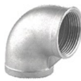
Elbow 90 Equal Banded F/F