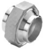
Union Conical Joint BW/BW