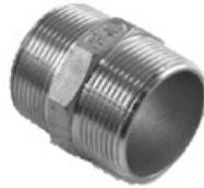
Hexagon Nipple (DIN/BSP)