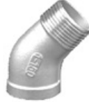
Street Elbow 45 M/F