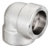
Elbow 90 Equal Banded Socket Weld