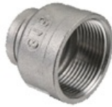
Socket (Coupling) Banded Reducing Weld