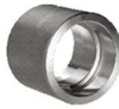
Socket (Coupling) Weld Plain