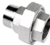
Union Conical Joint M/F