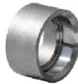
Half Socket (Half Coupling) Weld Plain