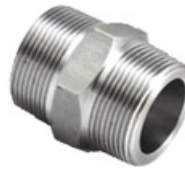
Hexagon Nipple (NPT/PT)