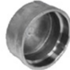
Round Cap Banded Socket Weld