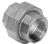
Union Conical Joint F/F