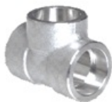
Tee Equal banded SW