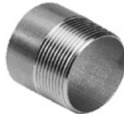
Welding Nipple From Pipe