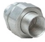
Union BW/M with Hexagon Nut