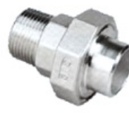
Union Flat Seat with Teflon Gasket BW/M