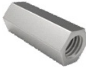
Hexagon Socket (Coupling) Plain