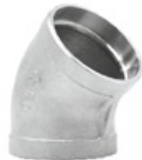
Elbow 45 Banded S/W