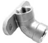
Elbow 45/60/75/90 with Strip