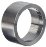
Socket (Coupling) Weld O.D. Machined