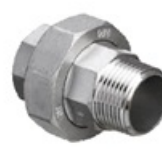
Union Flat Seat with Teflon Gasket M/F