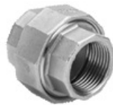
Union Flat Seat With Teflon Gasket F/F